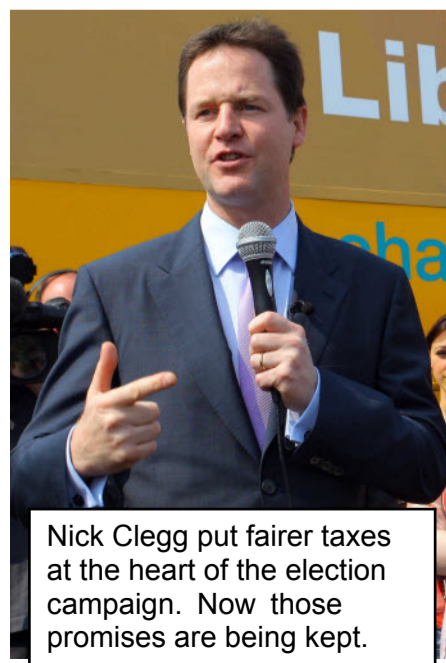
Nick Clegg put fairer taxes at the heart of the election campaign. Now those promises are being kept.

"This budget takes vital steps to putting our nation's finances back in order and delivering on our promise for fairer taxes made in the election."